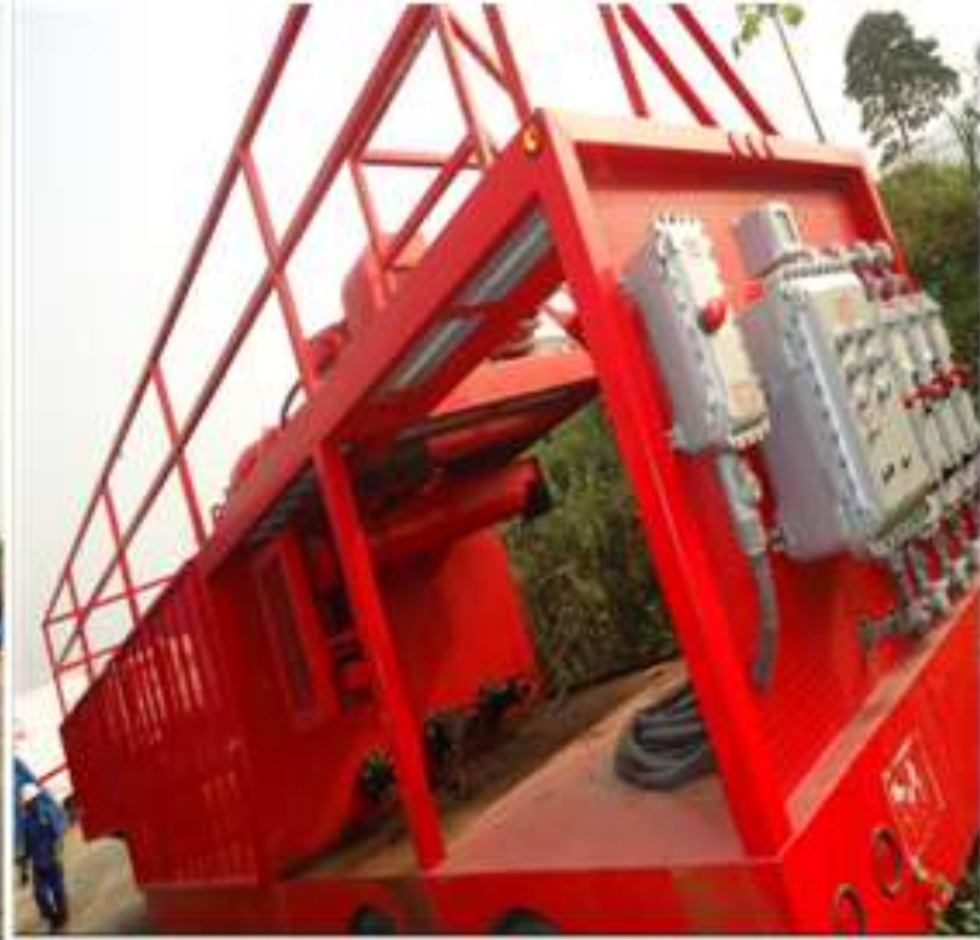
Non-man Entry Automated Tank Cleaning System (NEATS)